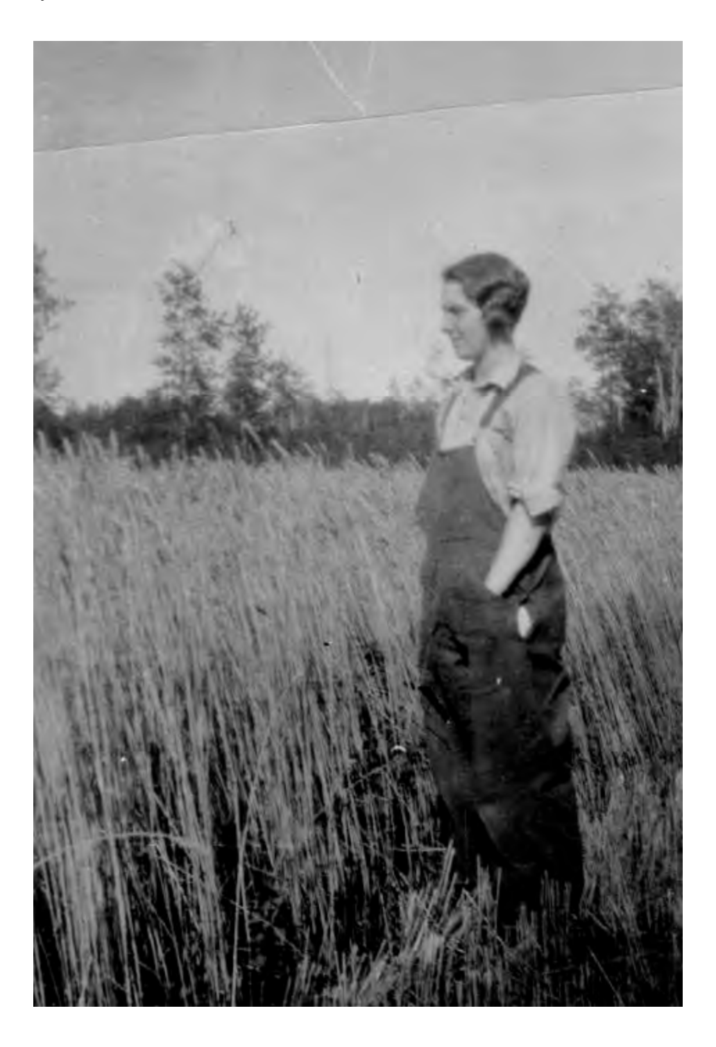
Before the hail

cash it would bring in was a high point for all three of them. Later that evening, a twenty minute hailstorm reduced that field of oats to a valueless mass of broken matted stalks. Two and a half years shot in twenty minutes. We were heartbroken! and wondered how we would manage through the year.