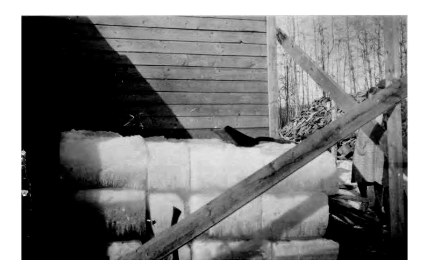
The blocks of ice in the ice house

One big end-of-winter job was cutting huge blocks of ice from the river, hauling it back to the farm on a stone boat and piling it in a shed, surrounded by sawdust. It was our farm-style refrigeration and if the blocks were big enough, the sawdust thick enough and the summer not too hot, it would last for several months, keeping our food safe.