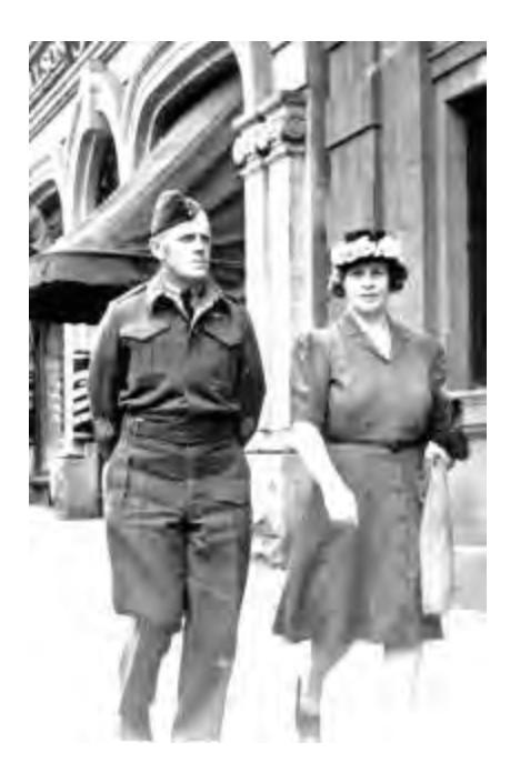
On an Edmonton street

the third floor of a big house in Rossdale. The "kitchen" was the landing between two rooms, and the bathroom was shared with the people living in the two suites on the second floor. We only stayed there a few months until a better place was found, just up the street, where there was big kitchen, a living room and two bedrooms upstairs. This time the bathroom was shared with the family who lived in the other part of the house; a family with 6 children! Maurice was too old to be sent overseas but he was stationed in Trenton, Regina and Nanaimo, teaching gunnery, for the duration of the war. Furloughs were infrequent and I missed him. Money was not plentiful but the regular cheque that came to me from the Army was a welcome change from the days on the farm when we were so broke.