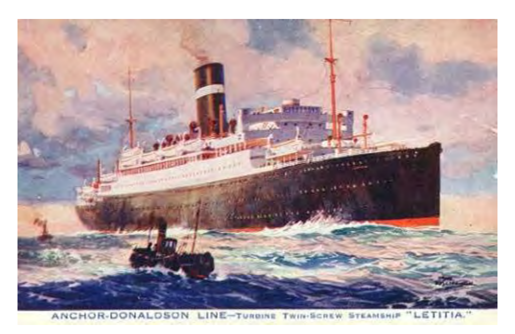
We arrived in Quebec City on Nov. 11th.